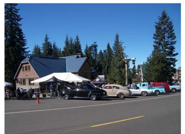
Classic Car Cruise-In