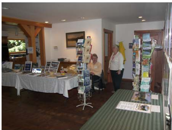
Booths & Displays

Featuring Nationally Renowned Solo Artist