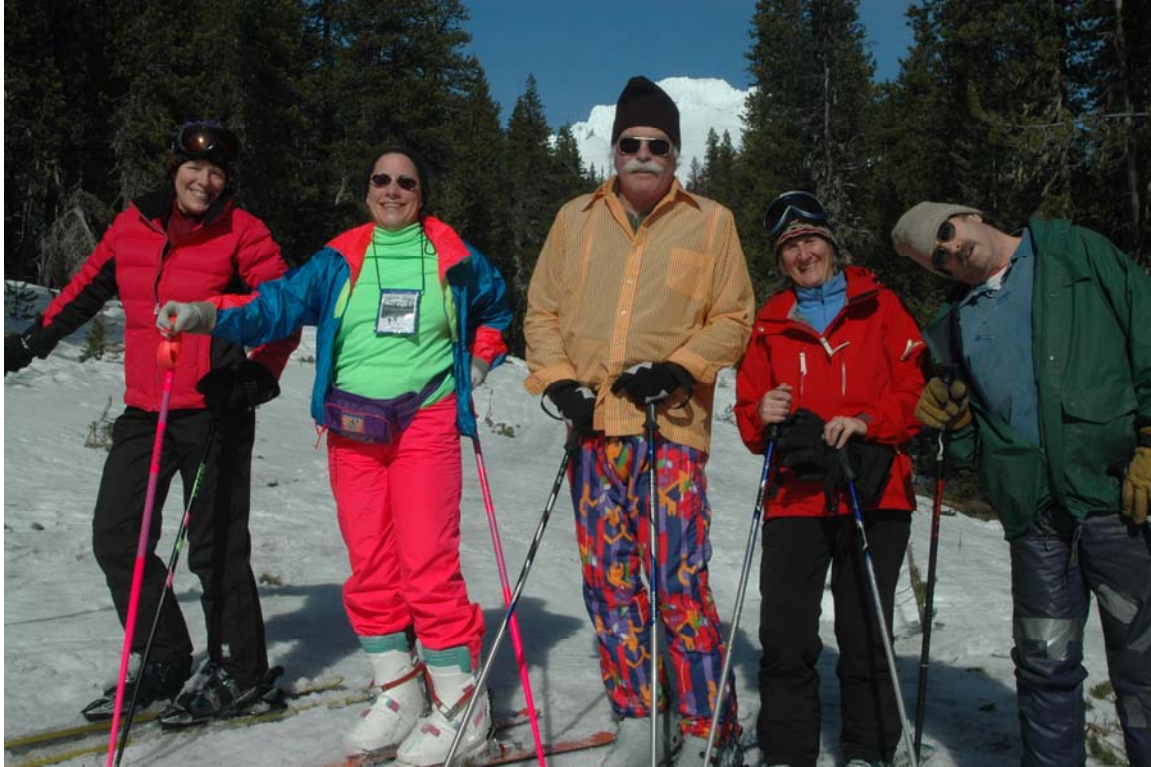
This group of Ski the Glade 2010 participants dug deep in their closet for these 1970's vintage clothing.